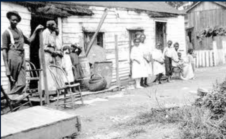
A black family and their home after the Civil War was over.